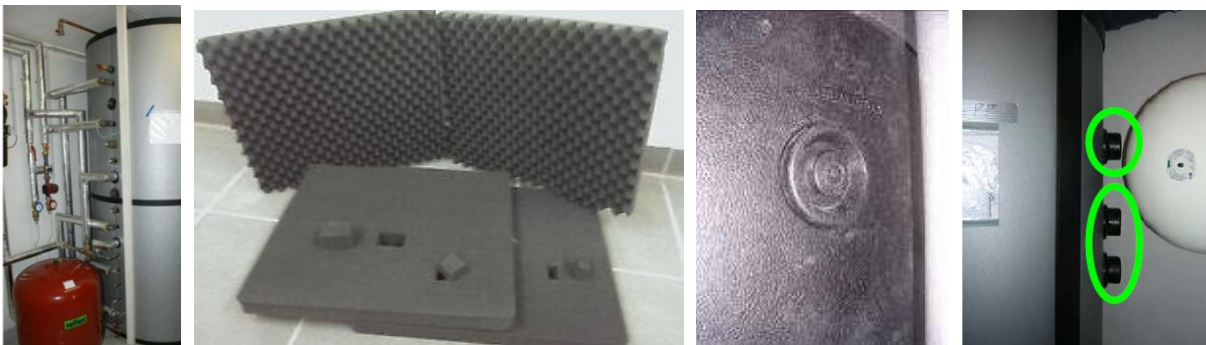
Fig 2. Tank pipe connections: bad example (left) and examples for improvements with pre-cut thermal insulation to be chosen when needed (middle) or insulation plugs for unused pipe connections (right) [4]