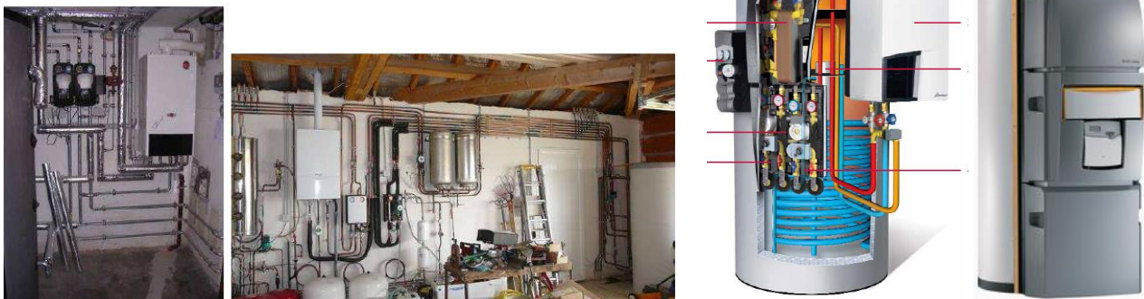
Fig 2. Examples of often existing bad hydraulic installations (left) and examples for compact solutions with minimized pipe length within the system (right) [4]